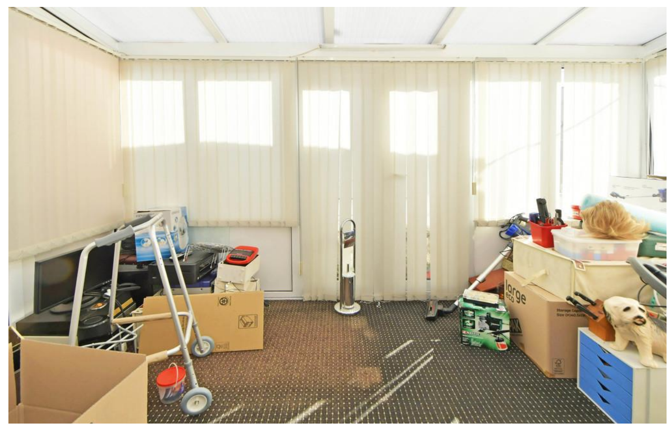
Lavender Close, Weston Coyney, Stoke-on-trent 3 Bedrooms, 1 Bathroom Auction Guide Price £130,000