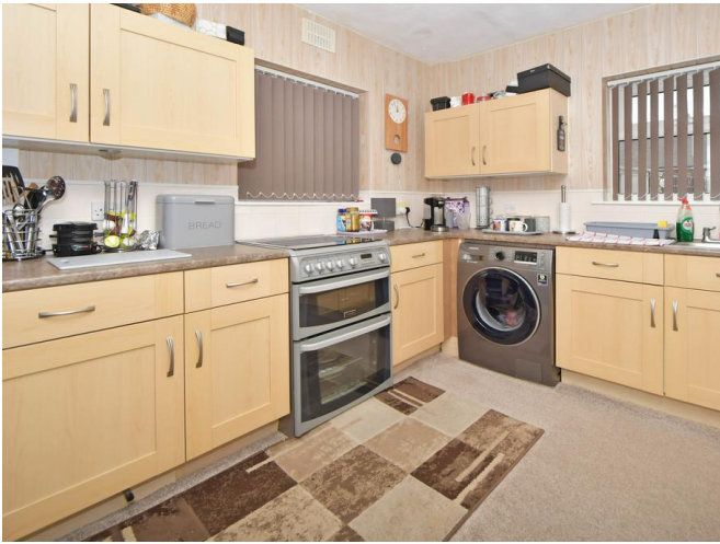
Double glazed window to the rear elevation, radiator.