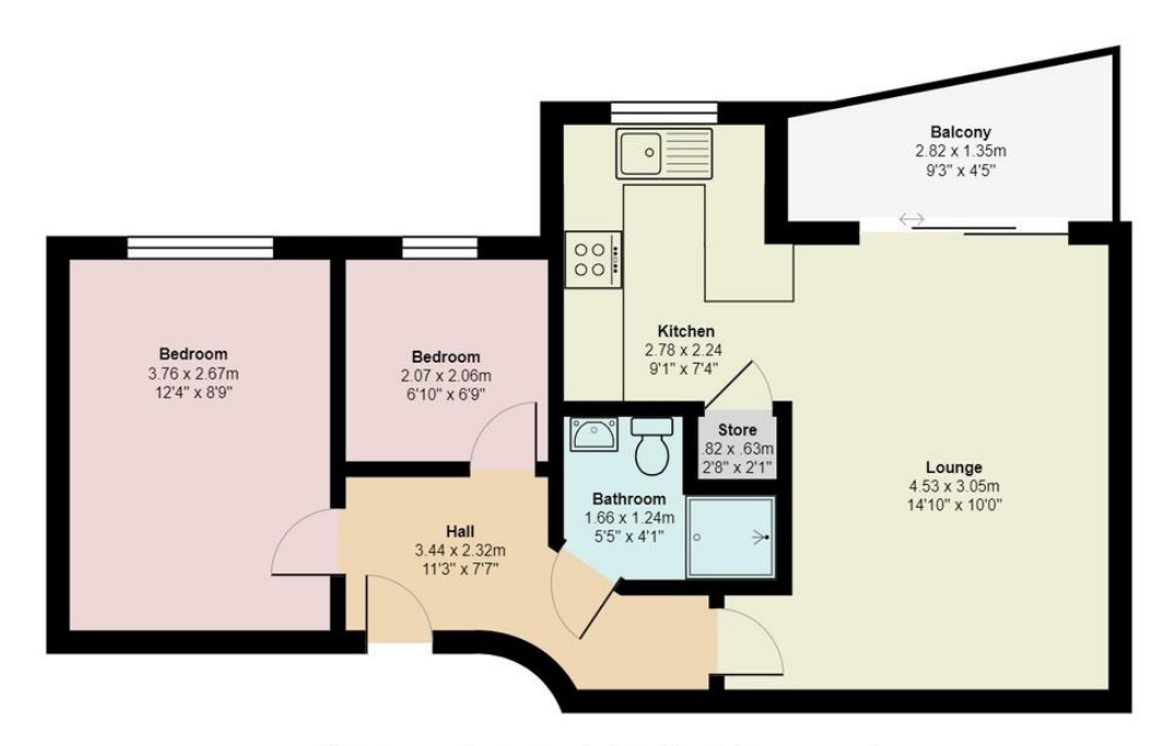
All measurements are approximate and for display purposes only