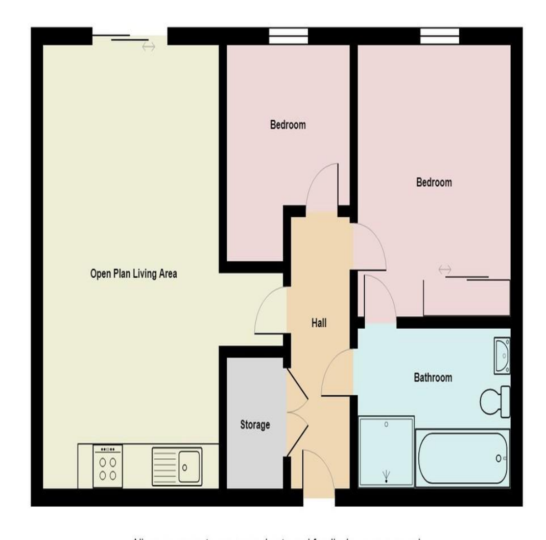
All measurements are approximate and for display purposes only

Martin & Co Newcastle under Lyme 57 Merrial Street • Newcastle under Lyme • ST5 2AE