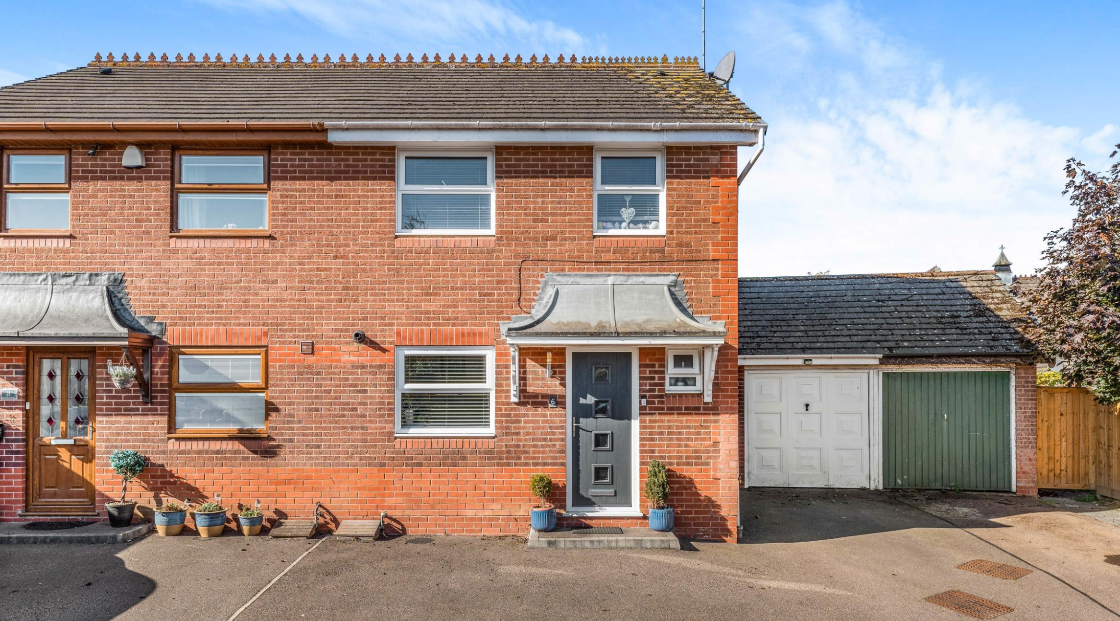
6 Waltham Gardens Banbury, OX16 4FD