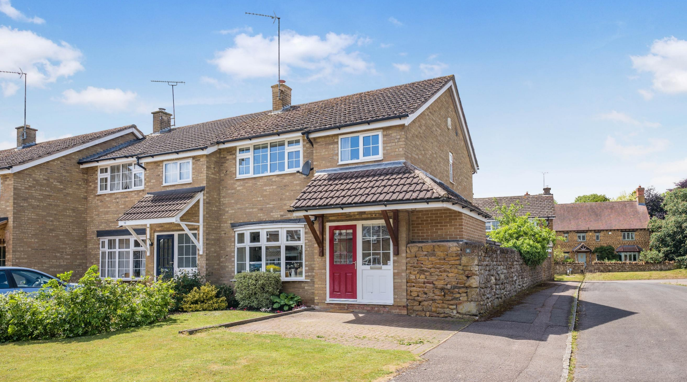
11 Gullivers Close, Horley Banbury, Oxfordshire, OX15 6DY