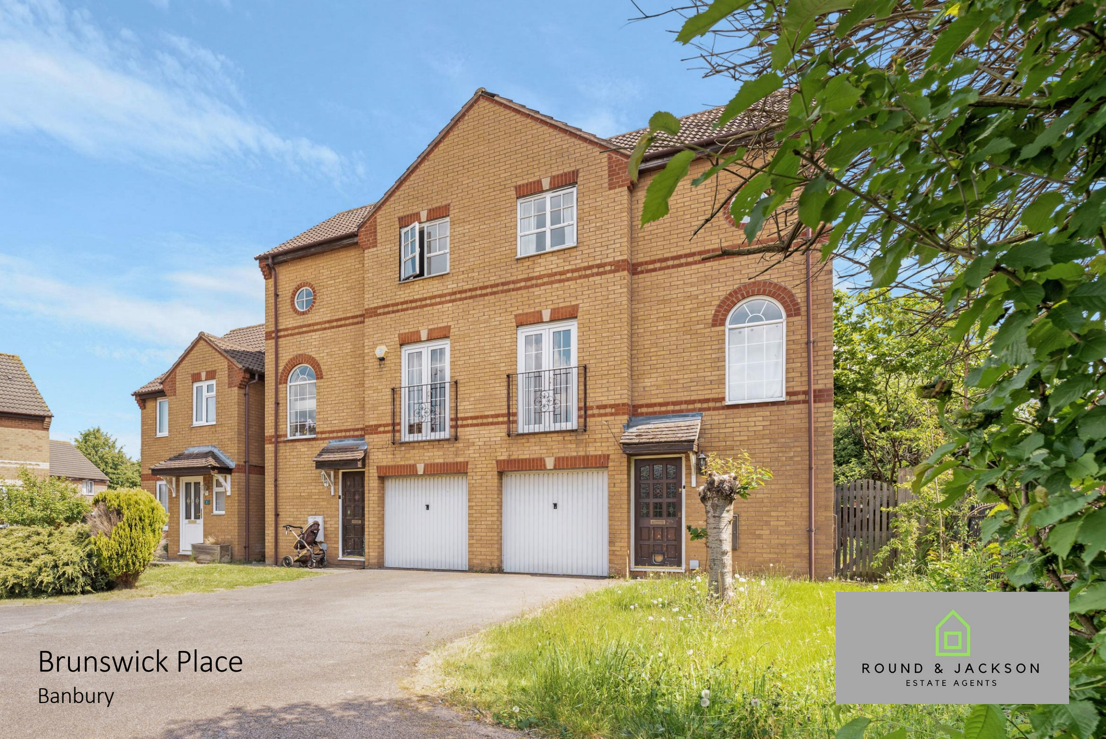
Brunswick Place Banbury