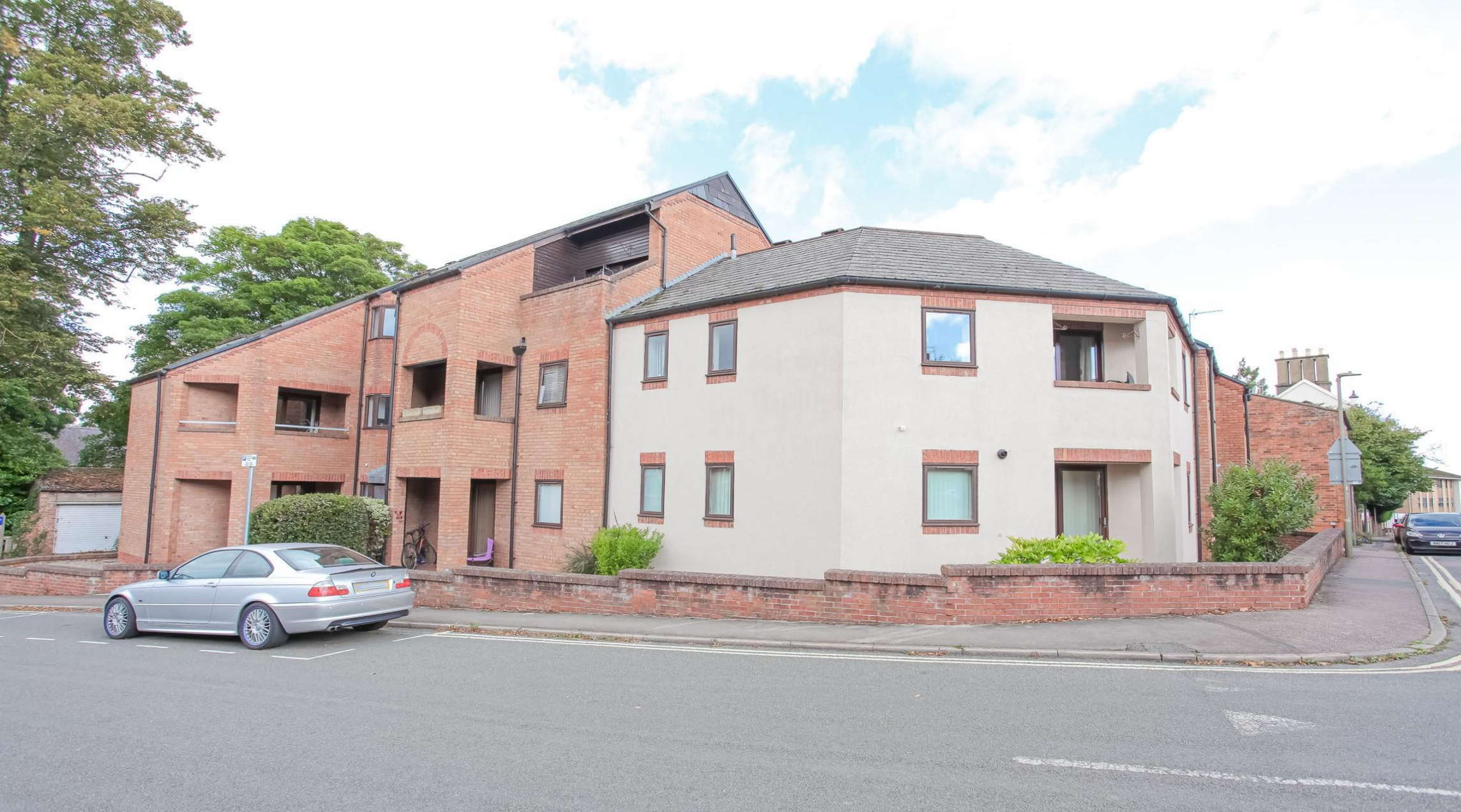
10 Upton Court, Crouch Street Banbury, Oxon, OX16 9PP