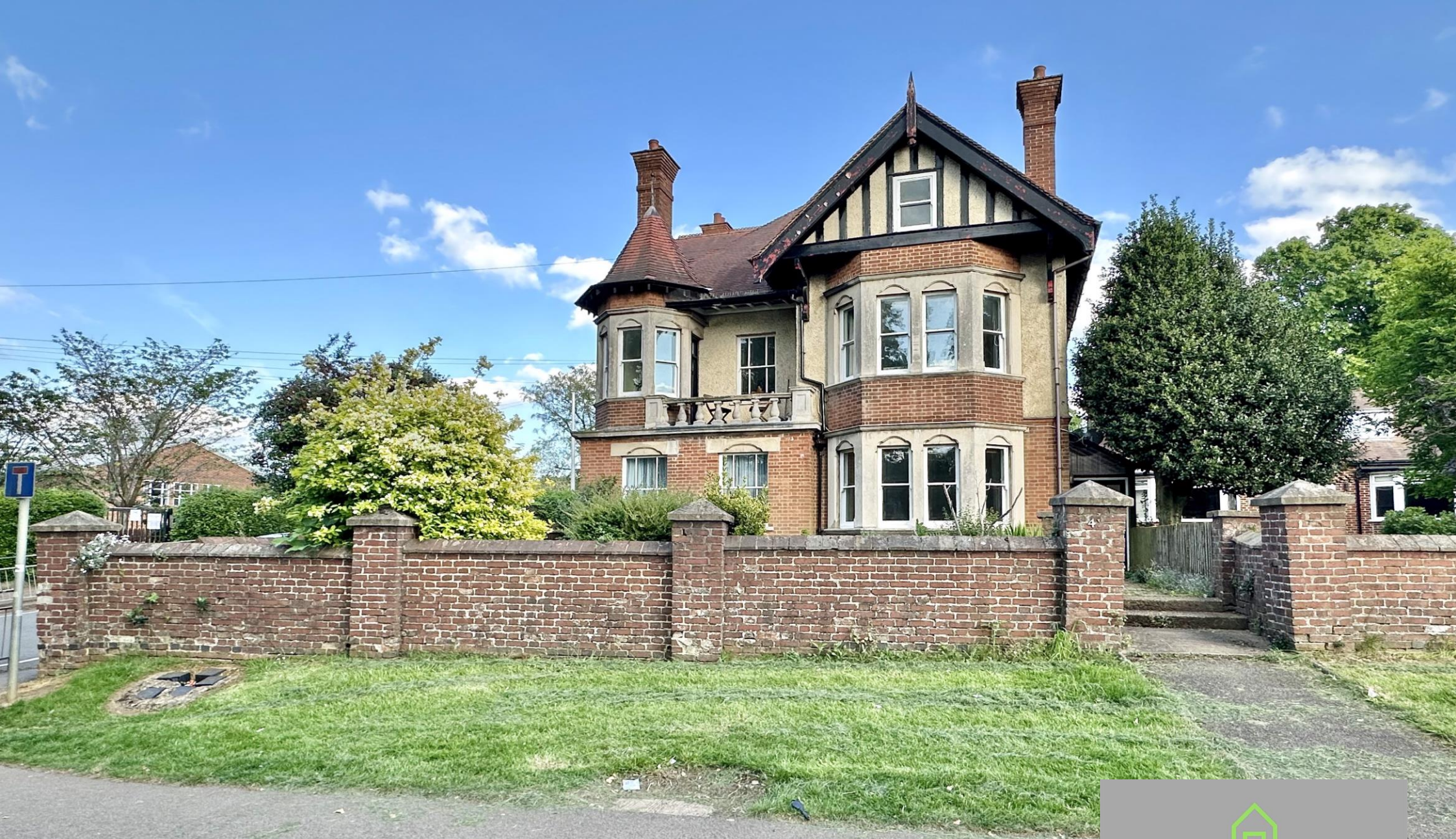
Apartment 5, Moreland House, 41 Bloxham Road Banbury