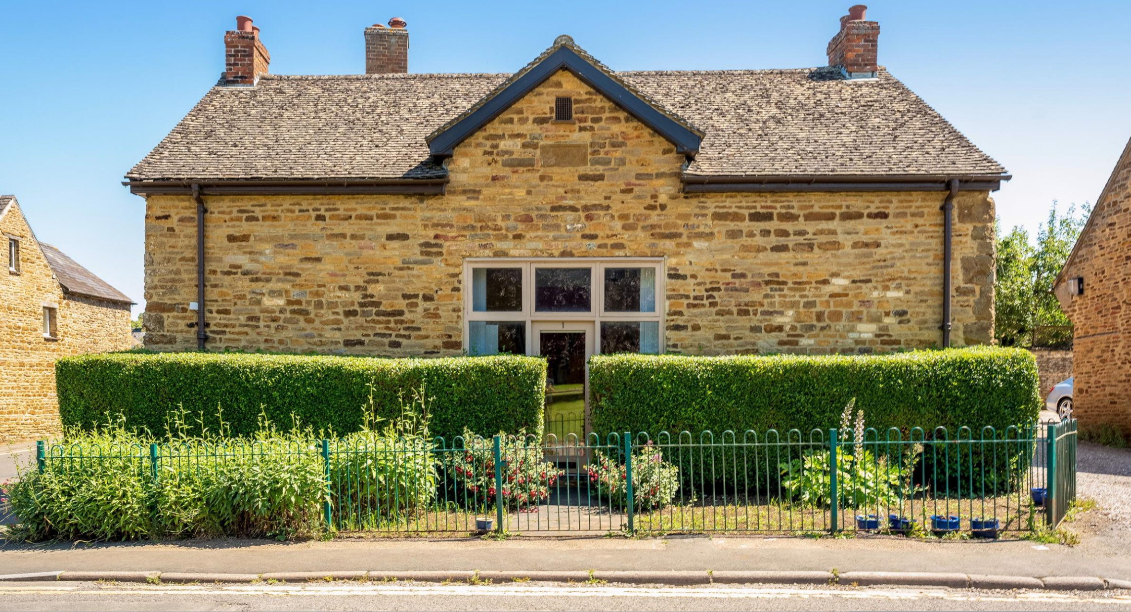
1 The Square, Kings Sutton Banbury, Oxfordshire, OX17 3RF