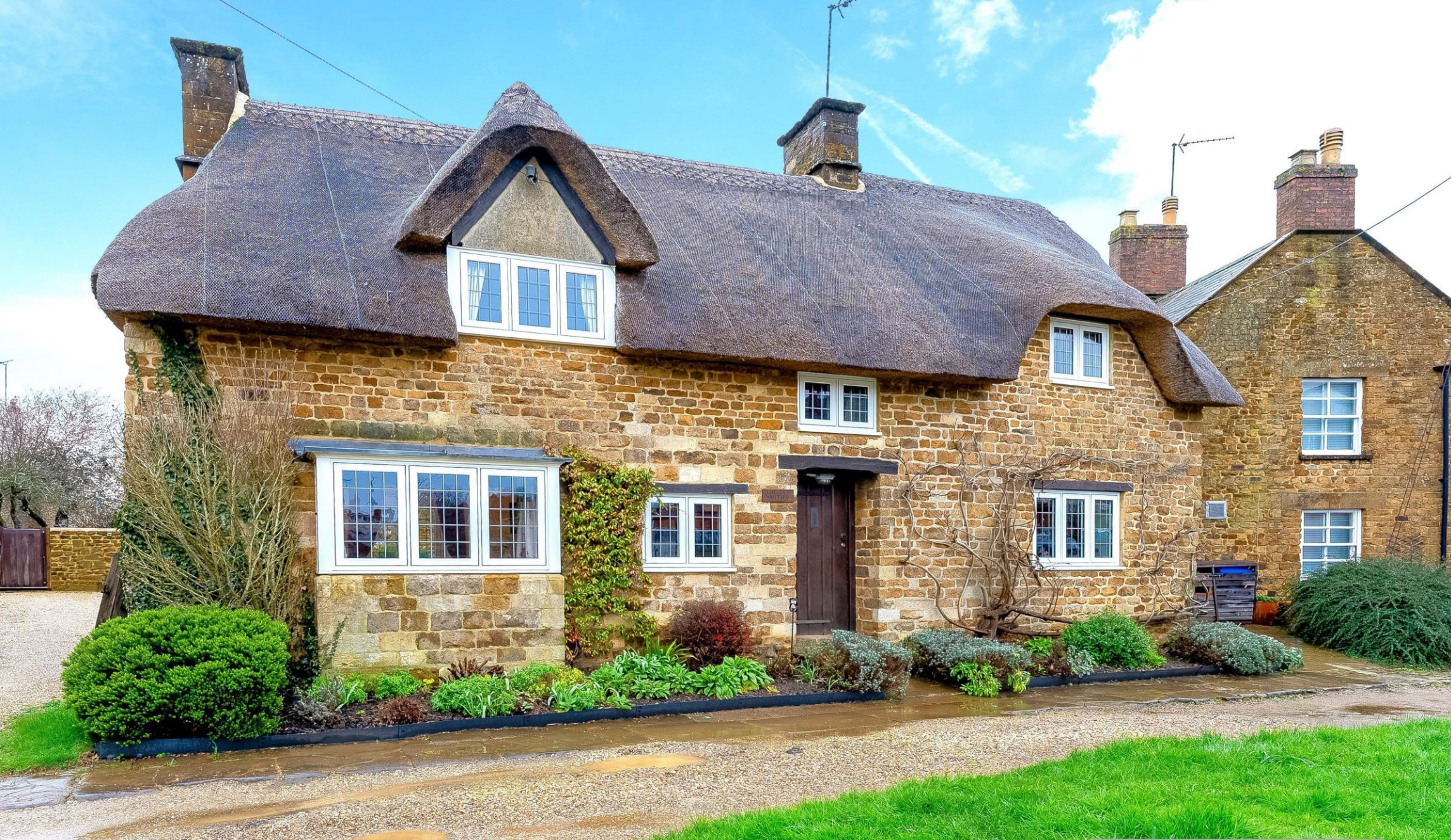
The Old Smithy Bloxham