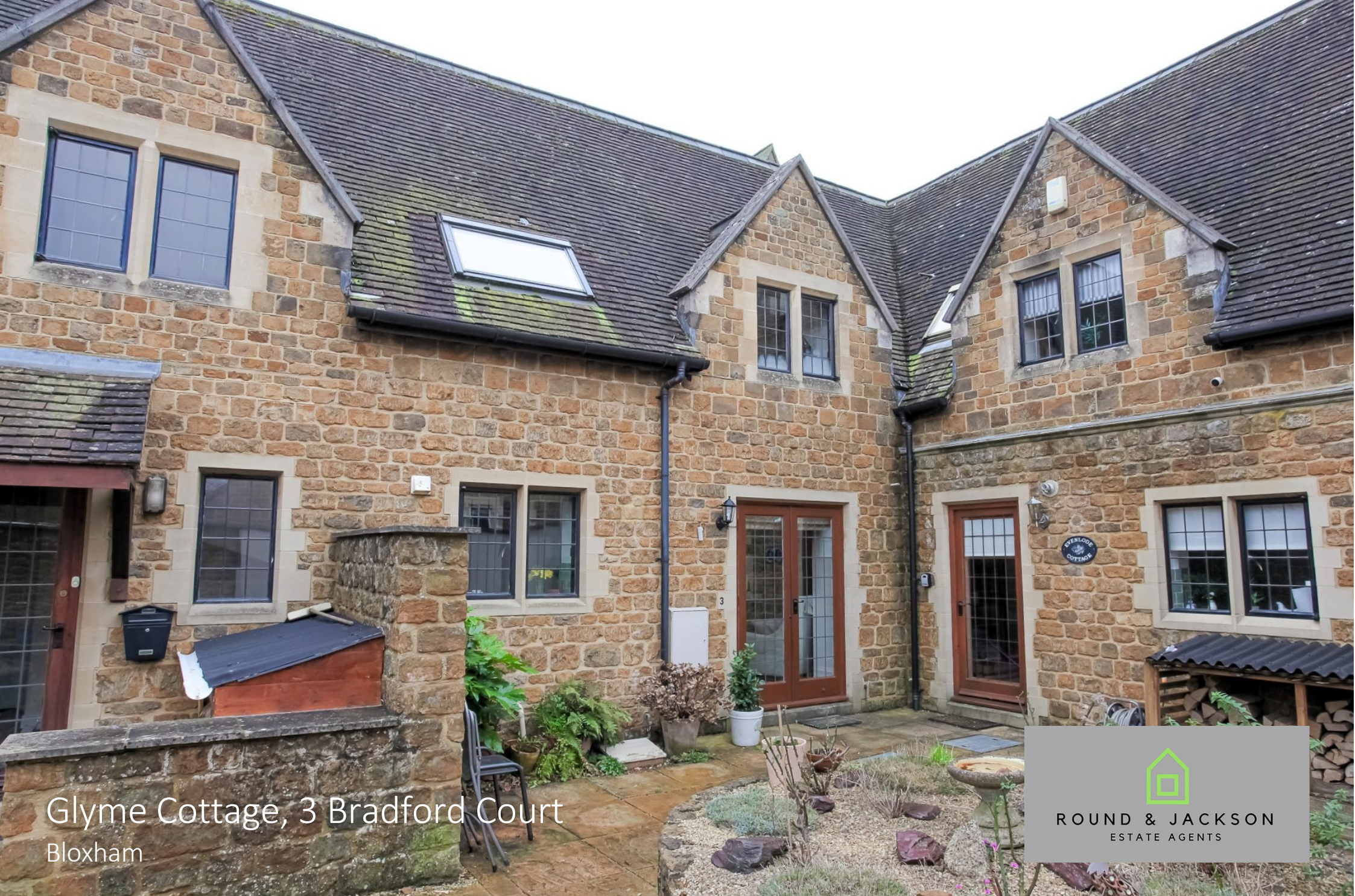
Glyme Cottage, 3 Bradford Court Bloxham