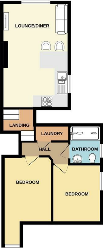
TOP FLOOR 557 sq.ft. (51.8 sq.m.) approx.

TOTAL FLOOR AREA : 557 sq.ft. (51.8 sq.m.) approx. Whilst every attempt has been made to ensure the accuracy of the floorplan contained here, measurements of doors, windows, rooms and any other items are approximate and no responsibility is taken for any error, omission or mis-statement. This plan is for illustrative purposes only and should be used as such by any prospective purchaser. The services, systems and appliances shown have not been tested and no guarantee as to their operability or efficiency can be given. Made with Metroplan ©2024