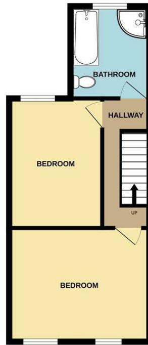
1ST FLOOR 380 sq.ft. (35.3 sq.m.) approx.