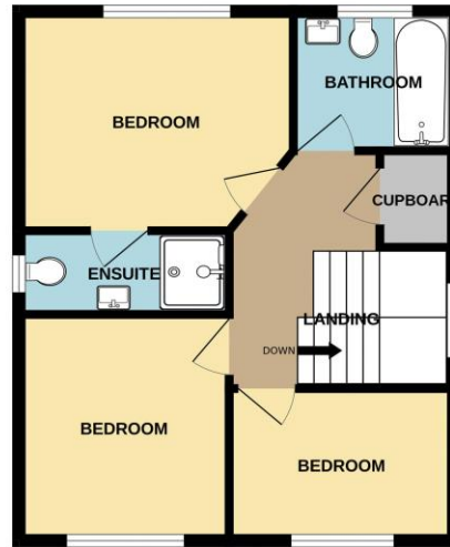
TOTAL FLOOR AREA: 1161 sq.ft. (107.8 sq.m.) approx.

Whilst every attempt has been made to ensure the accuracy of the floorplan contained here, measurements of doors, windows, rooms and any other items are approximate and no responsibility is taken for any error, omission or mis-statement. This plan is for illustrative purposes only and should be used as such by any prospective purchaser. The services, systems and appliances shown have not been tested and no guarantee as to their operability or efficiency can be given. Made with Metropix ©2024