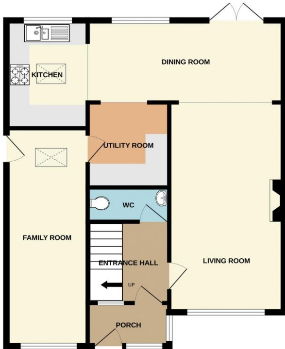
GROUND FLOOR 737 sq.ft. (68.5 sq.m.) approx.