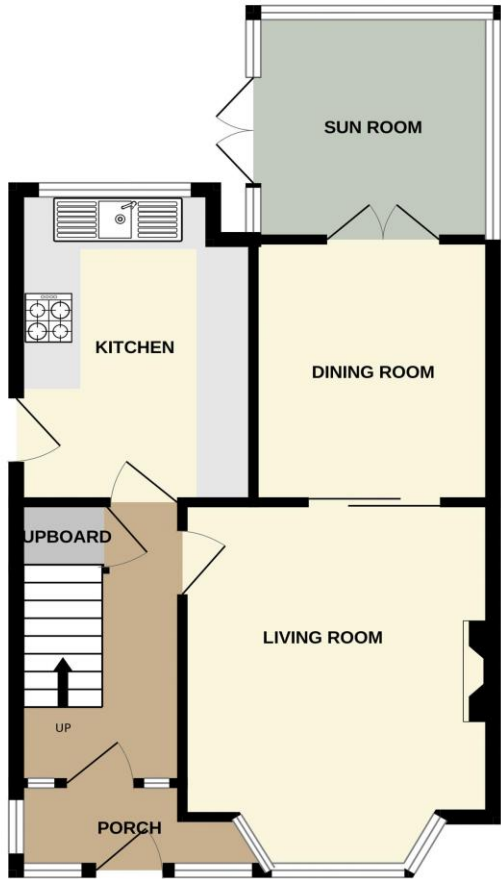
GROUND FLOOR 530 sq.ft. (49.2 sq.m.) approx.