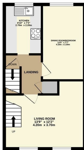
1ST FLOOR 353 sq.ft. (32.8 sq.m.) approx.