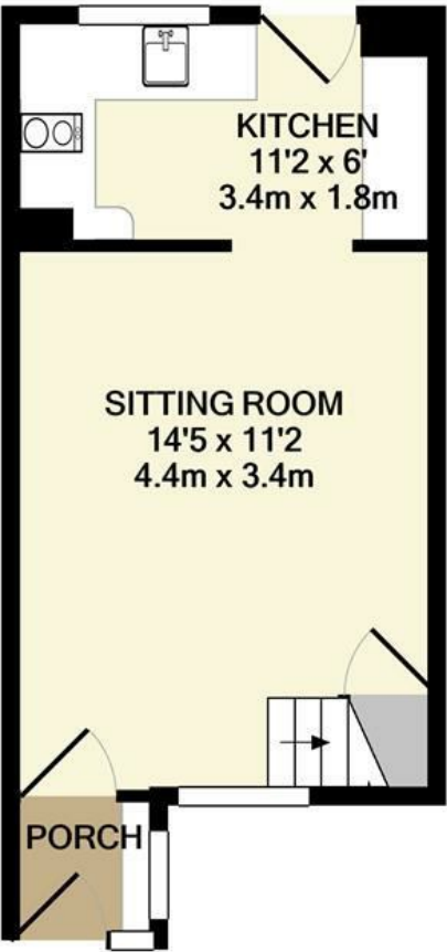
GROUND FLOOR APPROX. FLOOR AREA 239 SQ.FT. (22.2 SQ.M.)