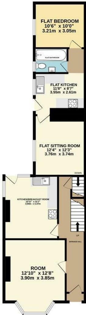
GROUND FLOOR 781 sq.ft. (72.6 sq.m.) approx.