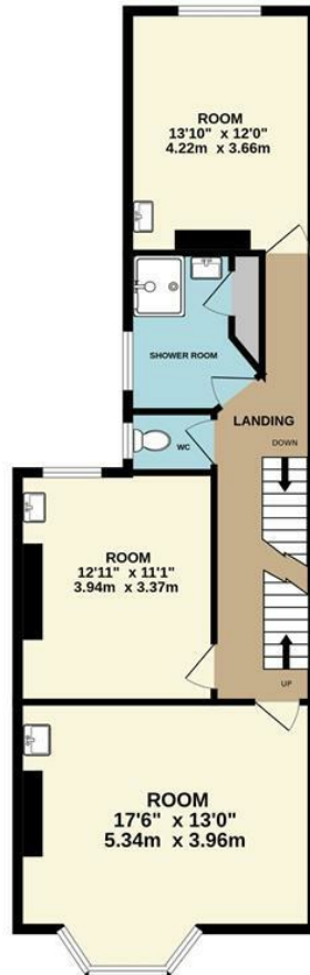
1ST FLOOR 695 sq.ft. (64.6 sq.m.) approx.