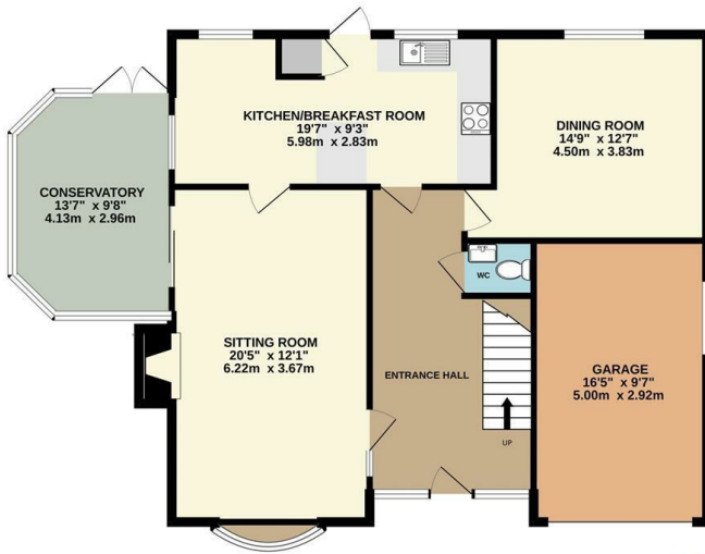
GROUND FLOOR 1088 sq.ft. (101.1 sq.m.) approx.