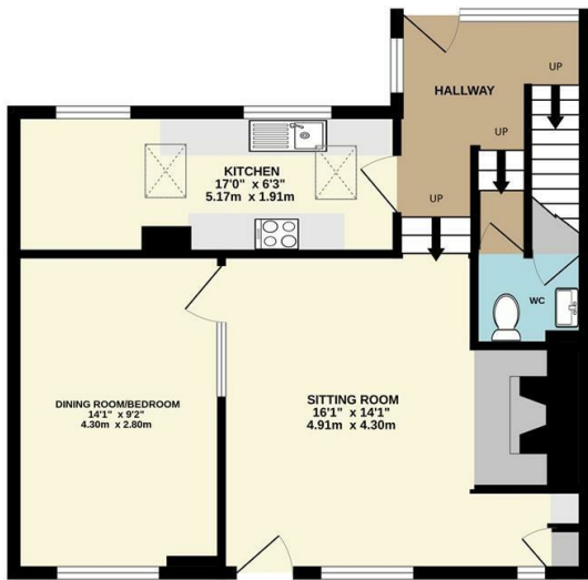
1ST FLOOR 344 sq.ft. (32.0 sq.m.) approx.