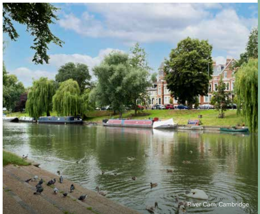
River Cam, Cambridge