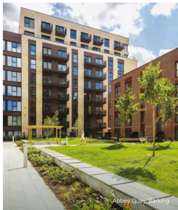
Abbey Quay, Barking