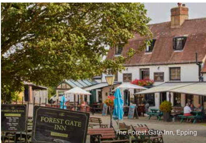
The Forest Gate Inn, Epping

There’s so much for youngsters to enjoy. Lee Valley Animal Adventure Park in Waltham Abbey is home to meerkats, wallabies and more, and hosts events year-round. Thrill seekers in the family? Nuclear High Ropes is just a 22-minute drive away in Kelvedon Hatch.