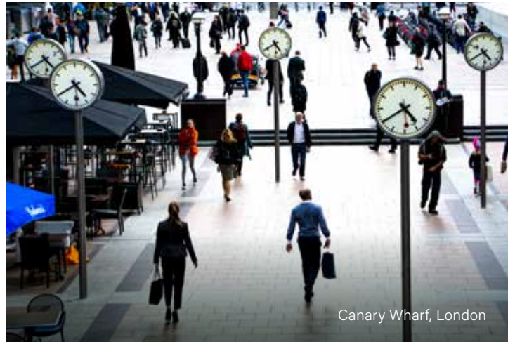
Canary Wharf, London