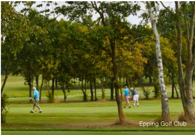
Epping Golf Club

Dining options are plentiful in Epping. Haywards sits proudly in the Michelin guide, serving seasonal dishes in a converted stable – and it’s just nine minutes away by car. Forest Bar & Kitchen serves highly-regarded Mediterranean cuisine, while Yakimono offers a Japanese menu designed for sharing. Other highlights include Coho Brasserie in Harlow and Quindici (Italian classics with a modern twist) in Loughton. Plus, The Cart Shed is on your doorstep in Thornwood – delight in wood-fired, locally farmed food.