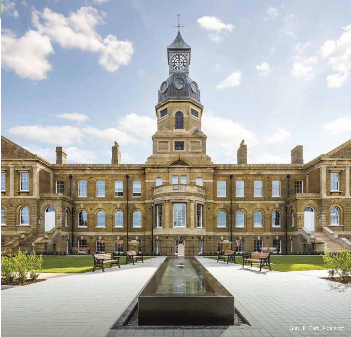
Gun Hill Park, Aldershot