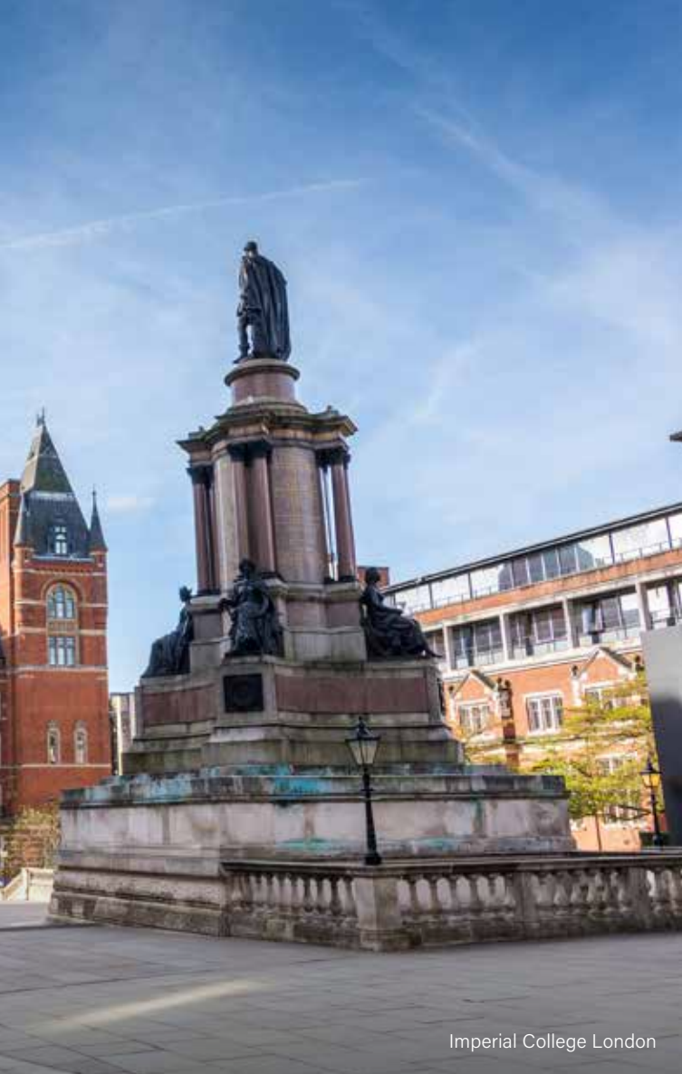
Imperial College London