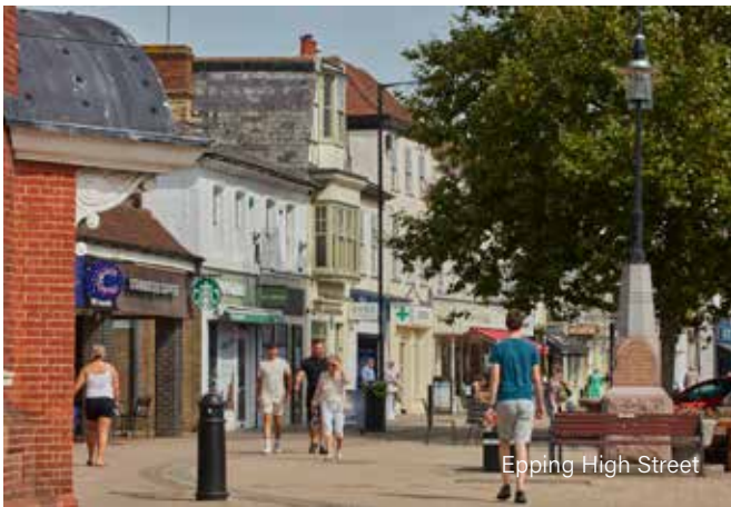
Epping High Street

Dining options are plentiful in Epping. Haywards sits proudly in the Michelin guide, serving seasonal dishes in a converted stable – and it’s just nine minutes away by car. Forest Bar & Kitchen serves highly-regarded Mediterranean cuisine, while Yakimono offers a Japanese menu designed for sharing. Other highlights include Coho Brasserie in Harlow and Quindici (Italian classics with a modern twist) in Loughton. Plus, The Cart Shed is on your doorstep in Thornwood – delight in wood-fired, locally farmed food.