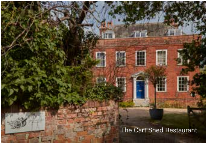
The Cart Shed Restaurant