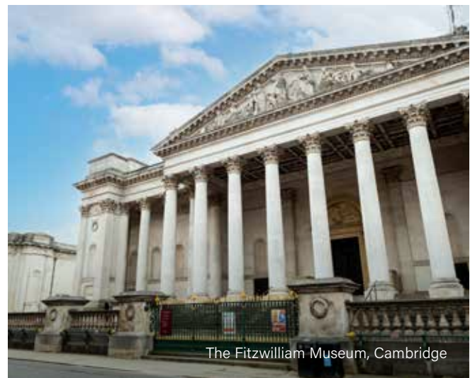
The Fitzwilliam Museum, Cambridge

You can go punting on the River Cam, enjoy a picnic in the park, join a walking tour of the city, or grab a pint at a riverside pub. Marvel at the many historic buildings – The Fitzwilliam Museum has over half a million works of art – and make sure you stop by Fitzbillies, the home of Chelsea buns.