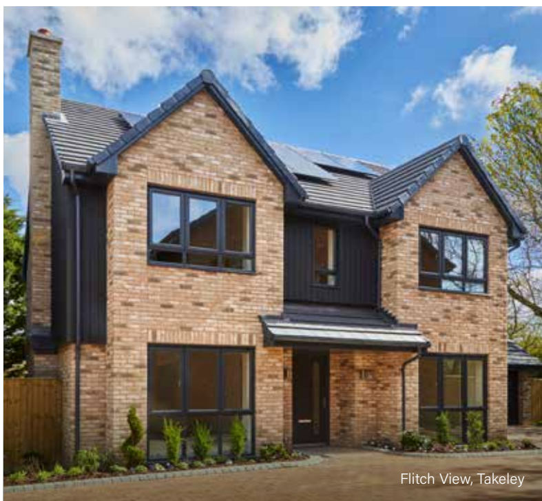
Flich View, Takeley