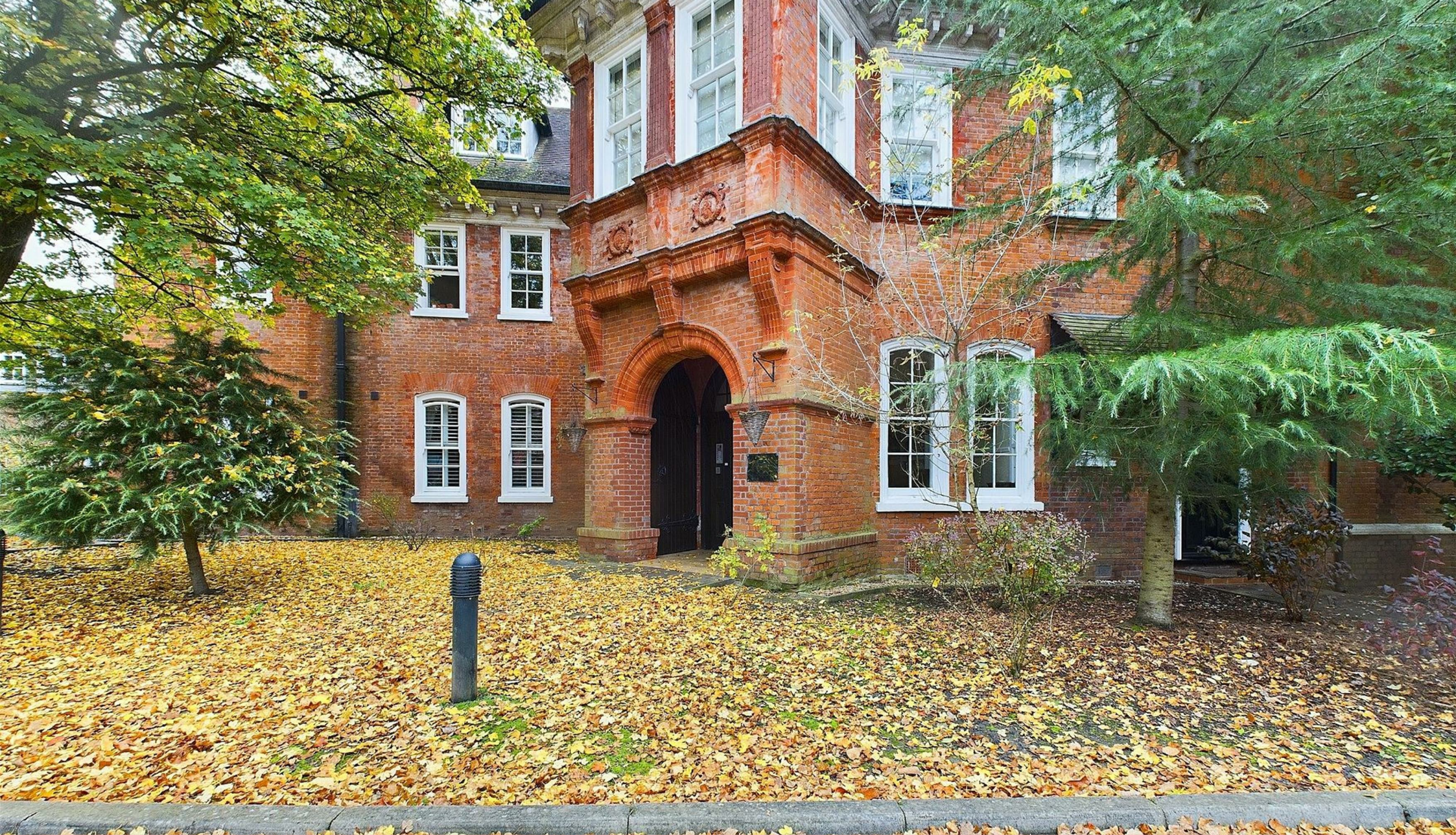
Highgrove House, Ruislip, HA4 8BP £1,450