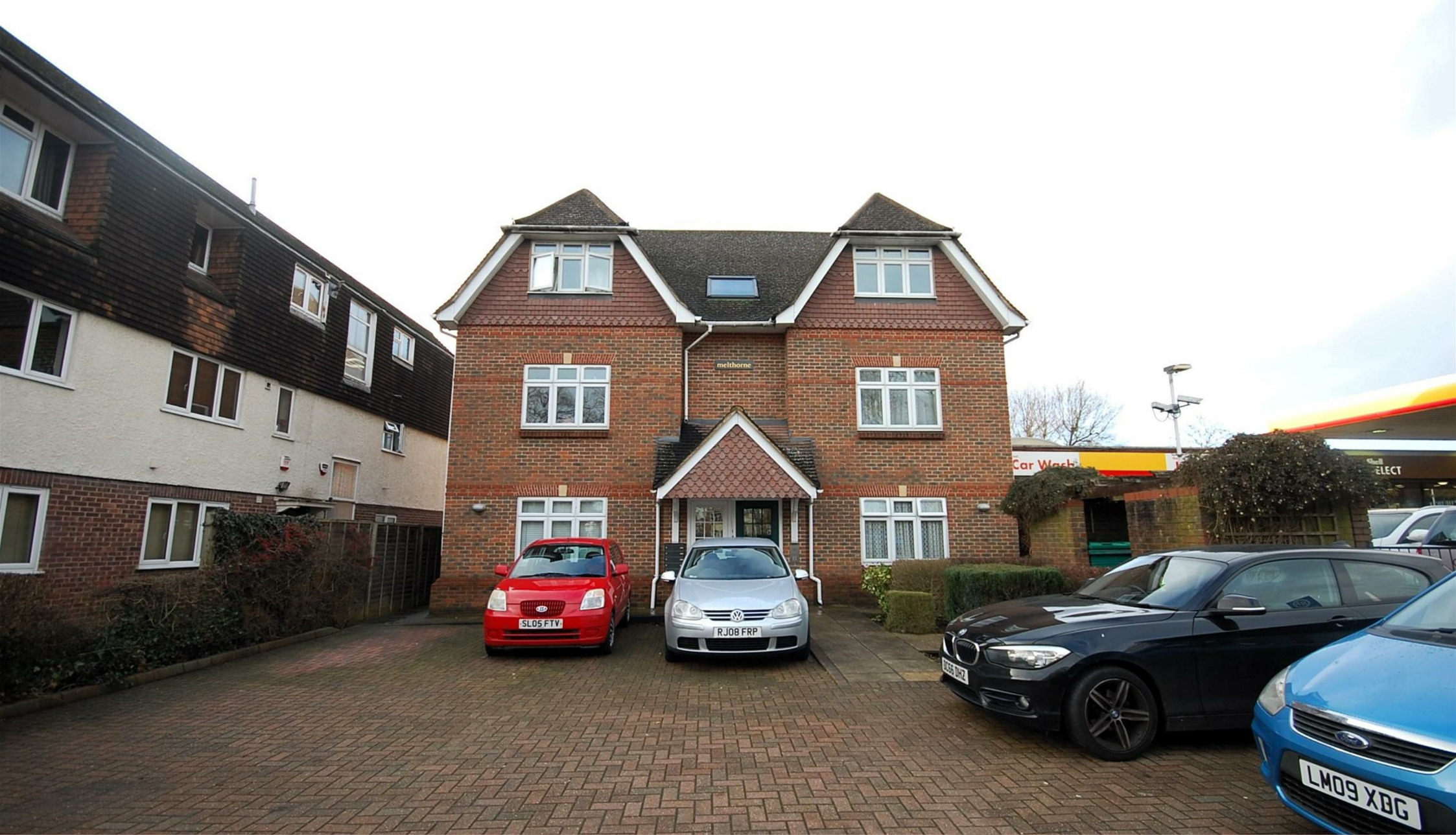
Melthorne Court, Ickenham, UB10 8LF £1,650 PCM