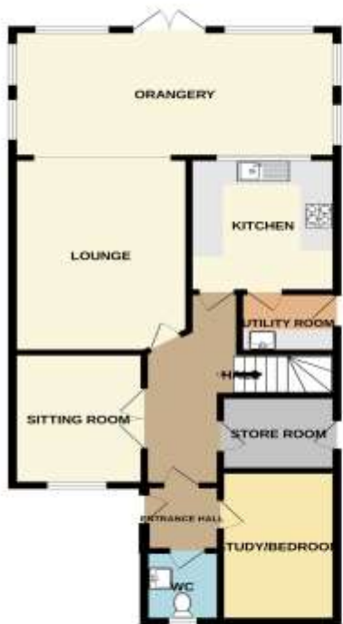
GROUND FLOOR 961 sq ft. (89.3 sq m.) approx.