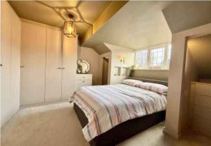
BEDROOM TWO 13' 1" max x 12' 3" (3.98m x 3.73m)