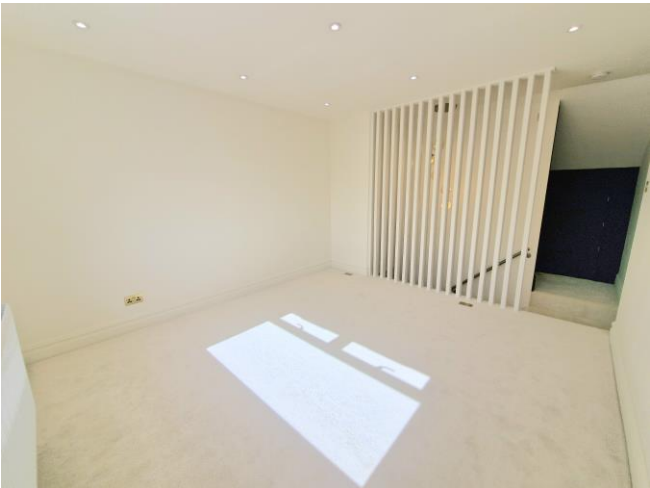
MASTER BEDROOM 12' 4" x 11' 6" (3.76m x 3.50m)