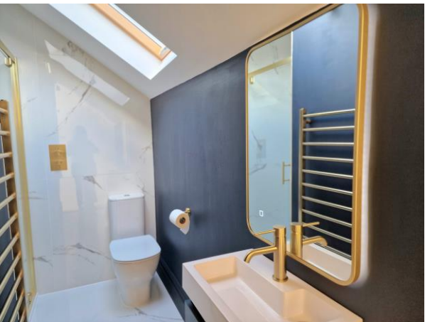
ENSUITE SHOWER ROOM 12' 8" x 6' 2" (3.86m x 1.88m)