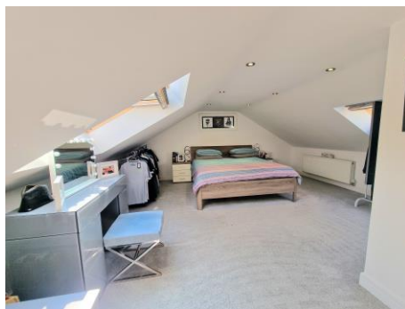
BEDROOM ONE 21' 0" x 16' 7" (6.40m x 5.05m)