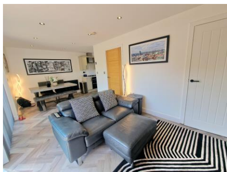
LIVING/ DINING / KITCHEN 20' 11" x 16' 7" (6.37m x 5.05m)