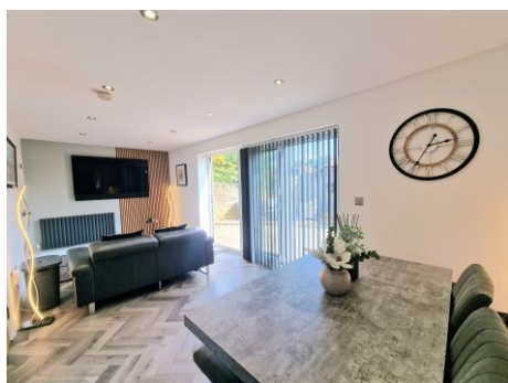
KITCHEN 14' 0" x 8' 11" (4.26m x 2.72m)