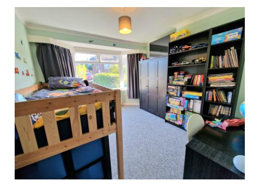
GROUND FLOOR BEDROOM TWO 6' 4" x 5' 8" (1.93m x 1.73m)