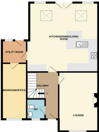
GROUND FLOOR 886 sq.ft. (82.4 sq.m.) approx.