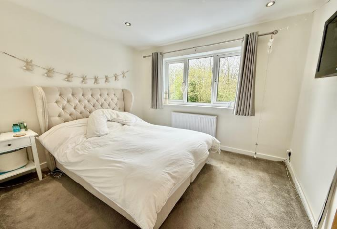
BEDROOM TWO 10' 2" x 8' 11" (3.10m x 2.72m)