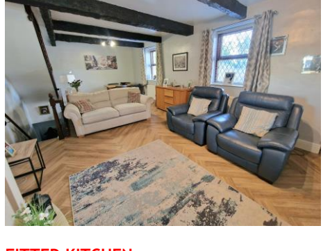
13' 8" x 12' 4" (4.16m x 3.76m)