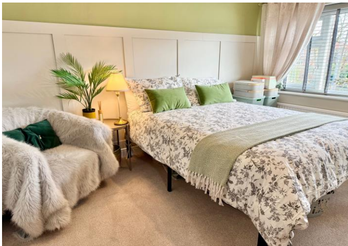
STUDY/OCCASIONAL BEDROOM 7' 0" x 6' 5" (2.13m x 1.95m)