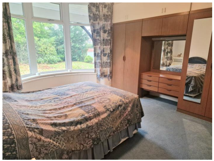
BEDROOM TWO 14' 1" x 10' 2" (4.29m x 3.10m)

MASTER BEDROOM 12' 11" x 11' 10" (3.93m x 3.60m)