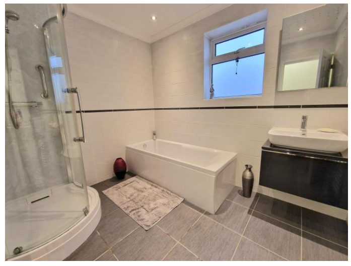
BATHROOM 8' 11" x 7' 2" (2.72m x 2.18m)

SEPARATE WC 7' 2" x 2' 10" (2.18m x 0.86m)