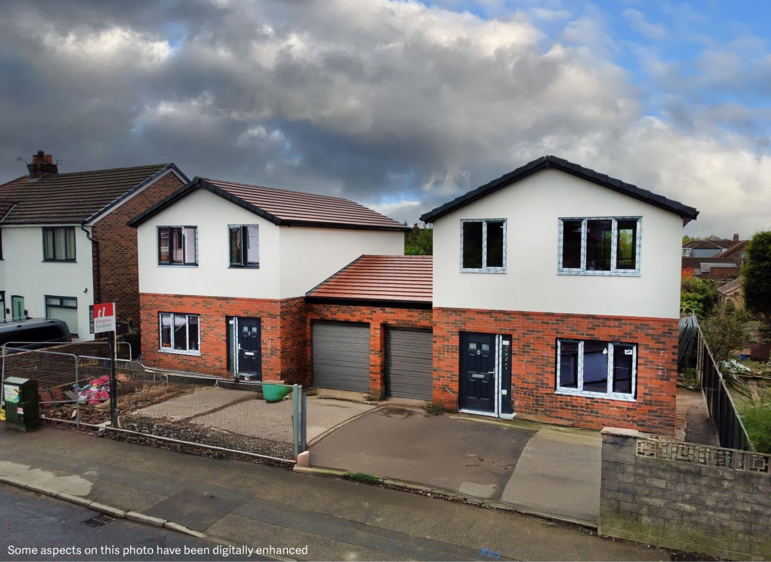
Some aspects on this photo have been digitally enhanced