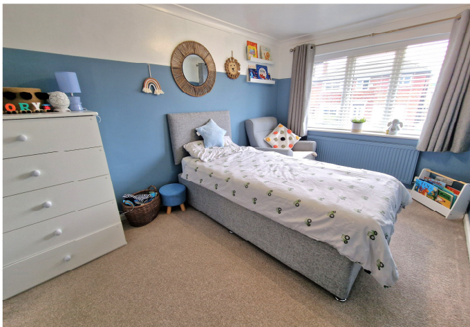
BEDROOM FOUR 10' 7" plus recess x 8' 5" (3.22m x 2.56m)