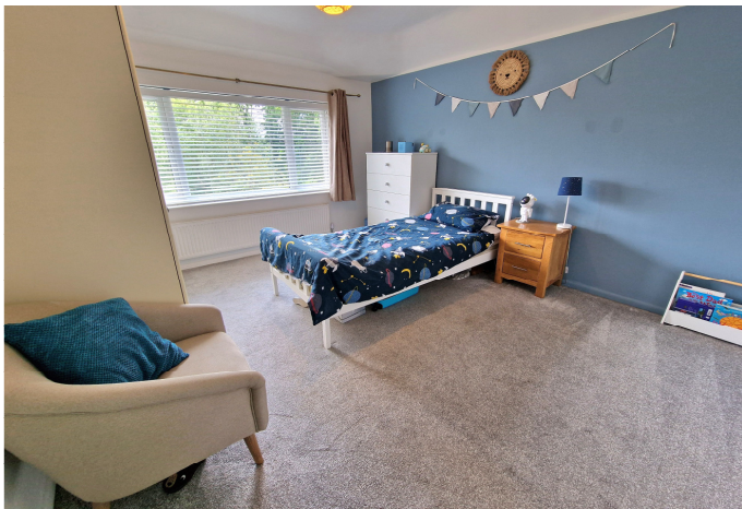
BEDROOM THREE 13' 6" into recess x 8' 5" (4.11m x 2.56m)