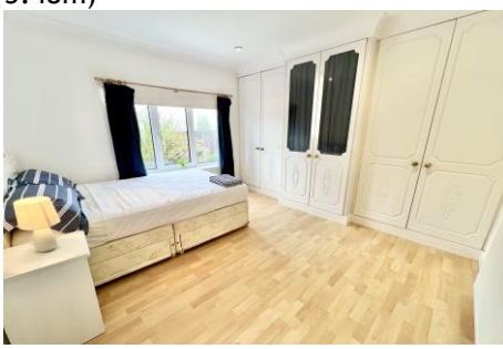
BEDROOM TWO 11' 9" x 11' 5" max (3.58m x 3.48m)

11' 9" x 11' 5" into wardrobes (3.58m x 3.48m)