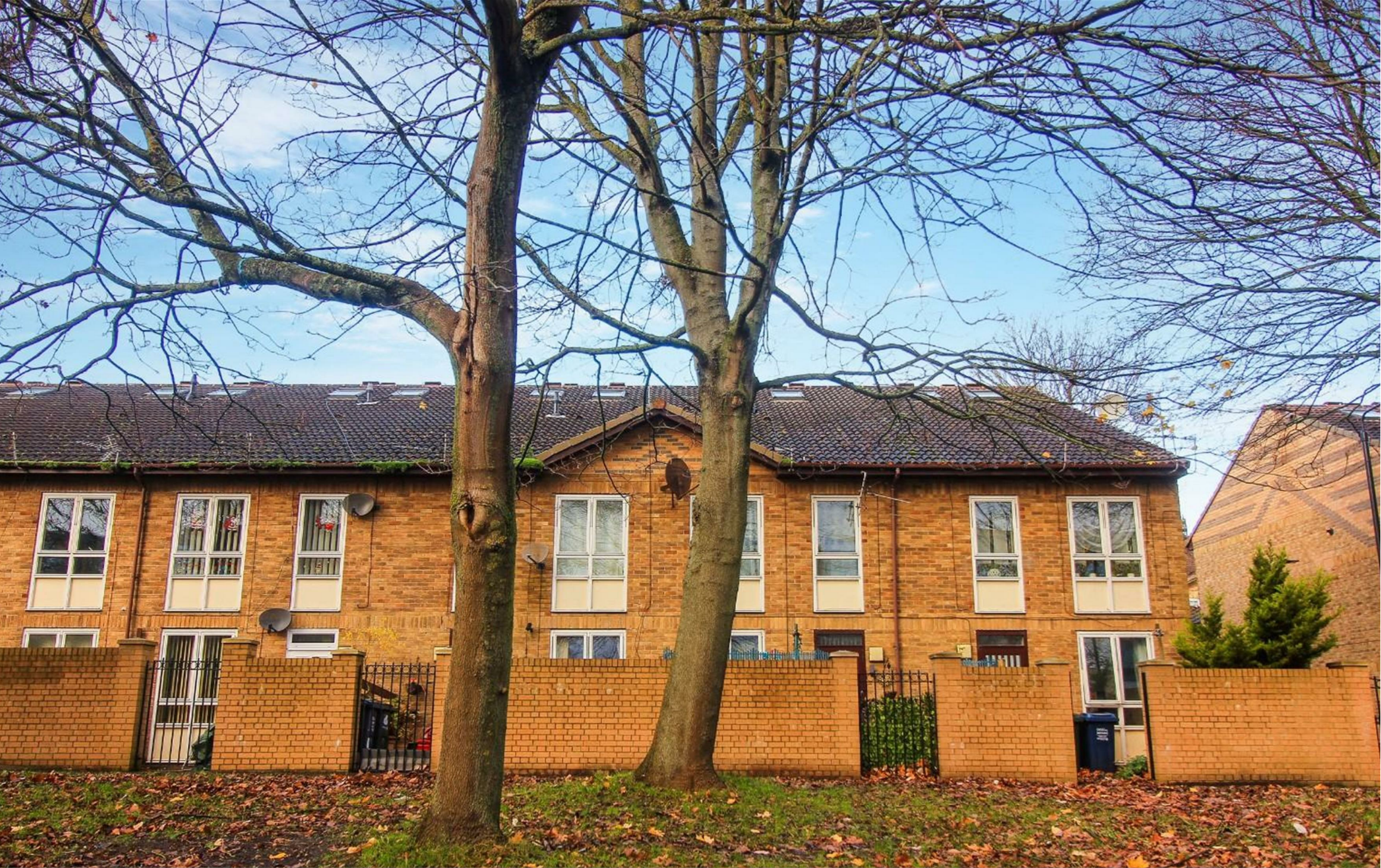
📍 Houston Court, Newcastle Upon Tyne NE4 6JB