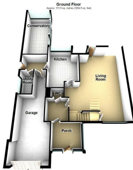
Ground Floor Approx. 111.9 sq. metres (1204.9 sq. feet)