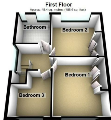
First Floor Approx. 45.4 sq. metres (488.6 sq. feet)

Total area: approx. 127.0 sq. metres (1367.5 sq. feet)