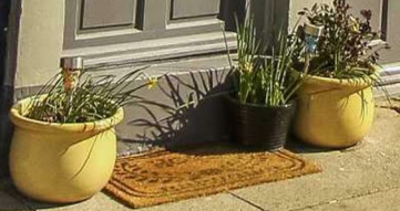
Whitley Road, Whitley Bay NE26 2NE