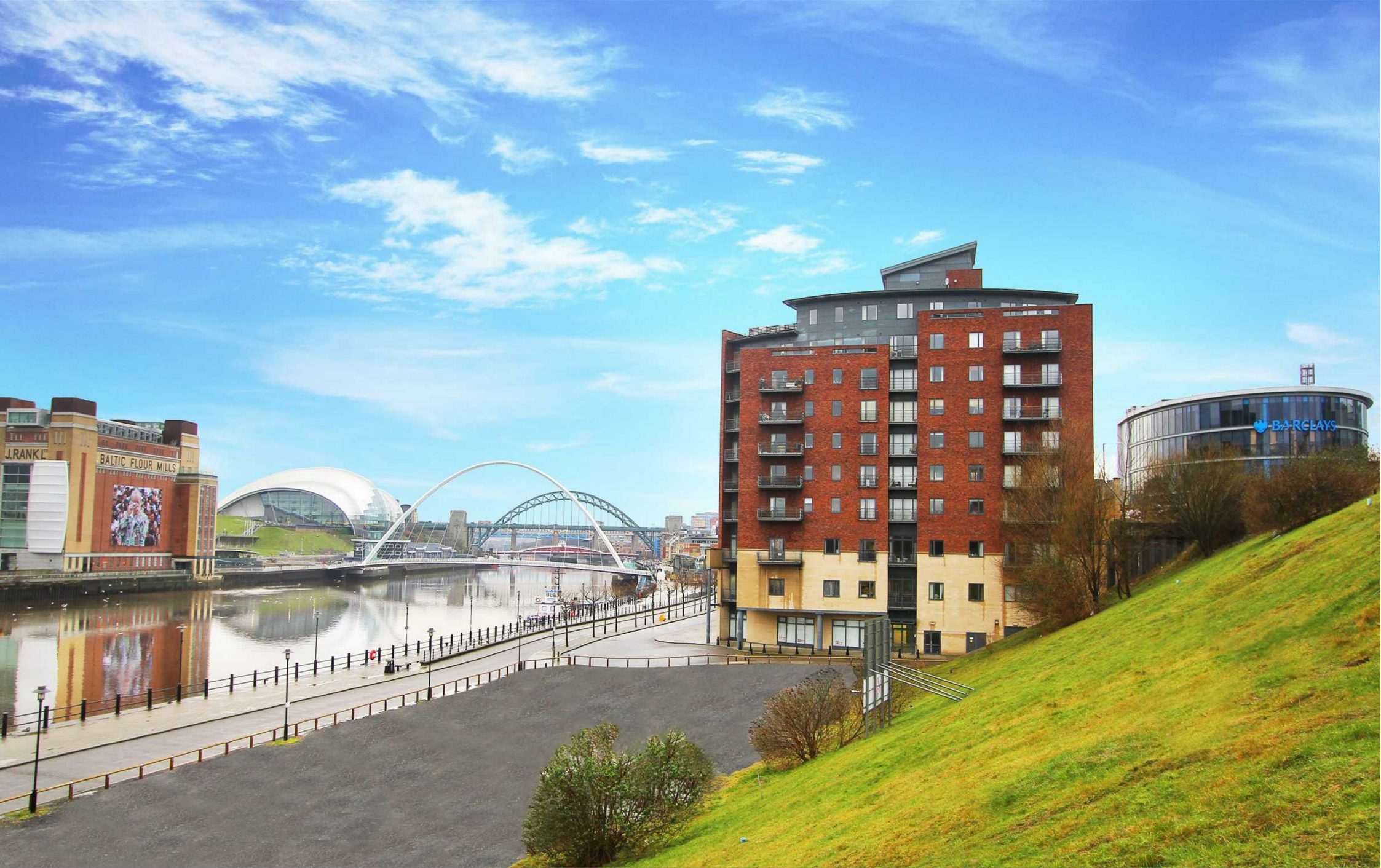
📍 St Annes Quay, Quayside NE1 3BB