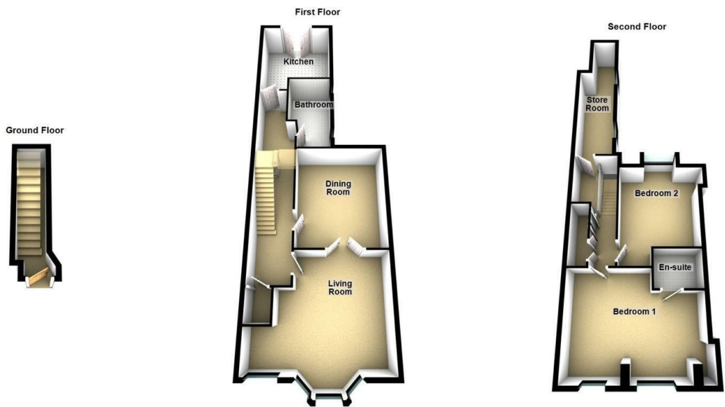
Total area: approx. 150.2 sq. metres (1616.5 sq. feet)