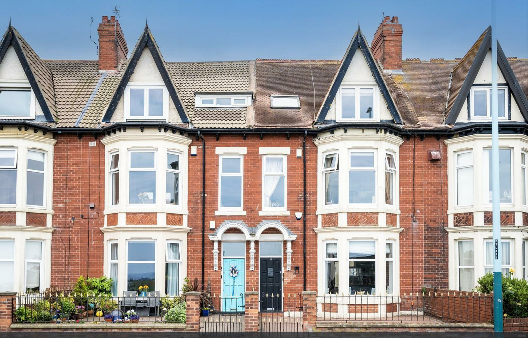
📍 The Links, Whitley Bay NE26 1PS