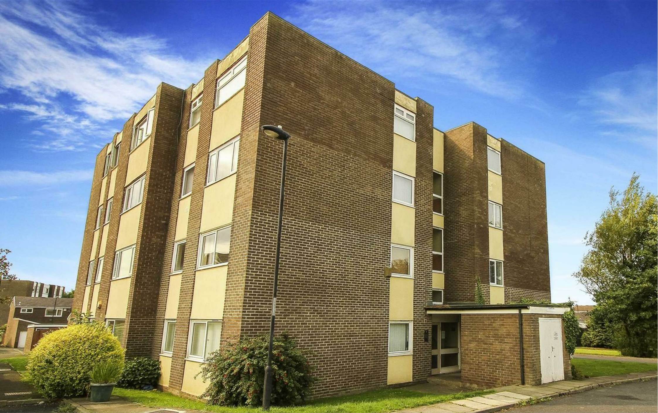
📍 Shaftoe Court, Lakeshore NE12 6YP