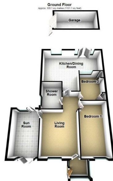
Total area: approx. 105.1 sq. metres (1131.1 sq. feet) Please be advised the floorplans are not drawn to scale and are to be used to give an idea of the layout of the property. Plan produced using PlanUp.