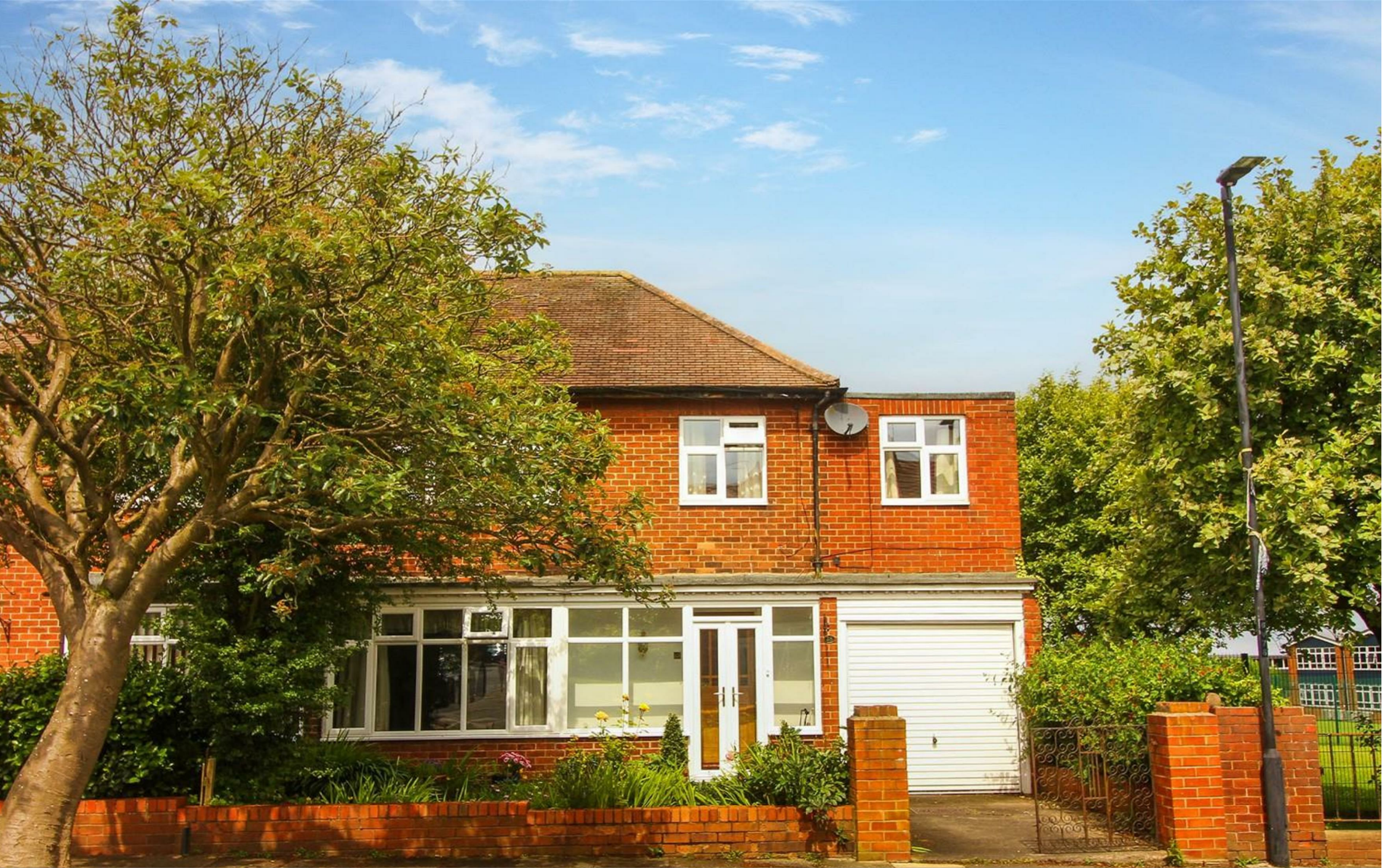
📍 Valley Gardens, Whitley Bay NE25 9AQ