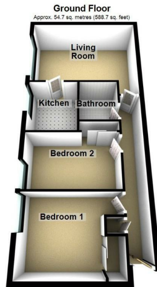
Ground Floor Approx. 54.7 sq. metres (588.7 sq. feet)

Total area: approx. 54.7 sq. metres (588.7 sq. feet)