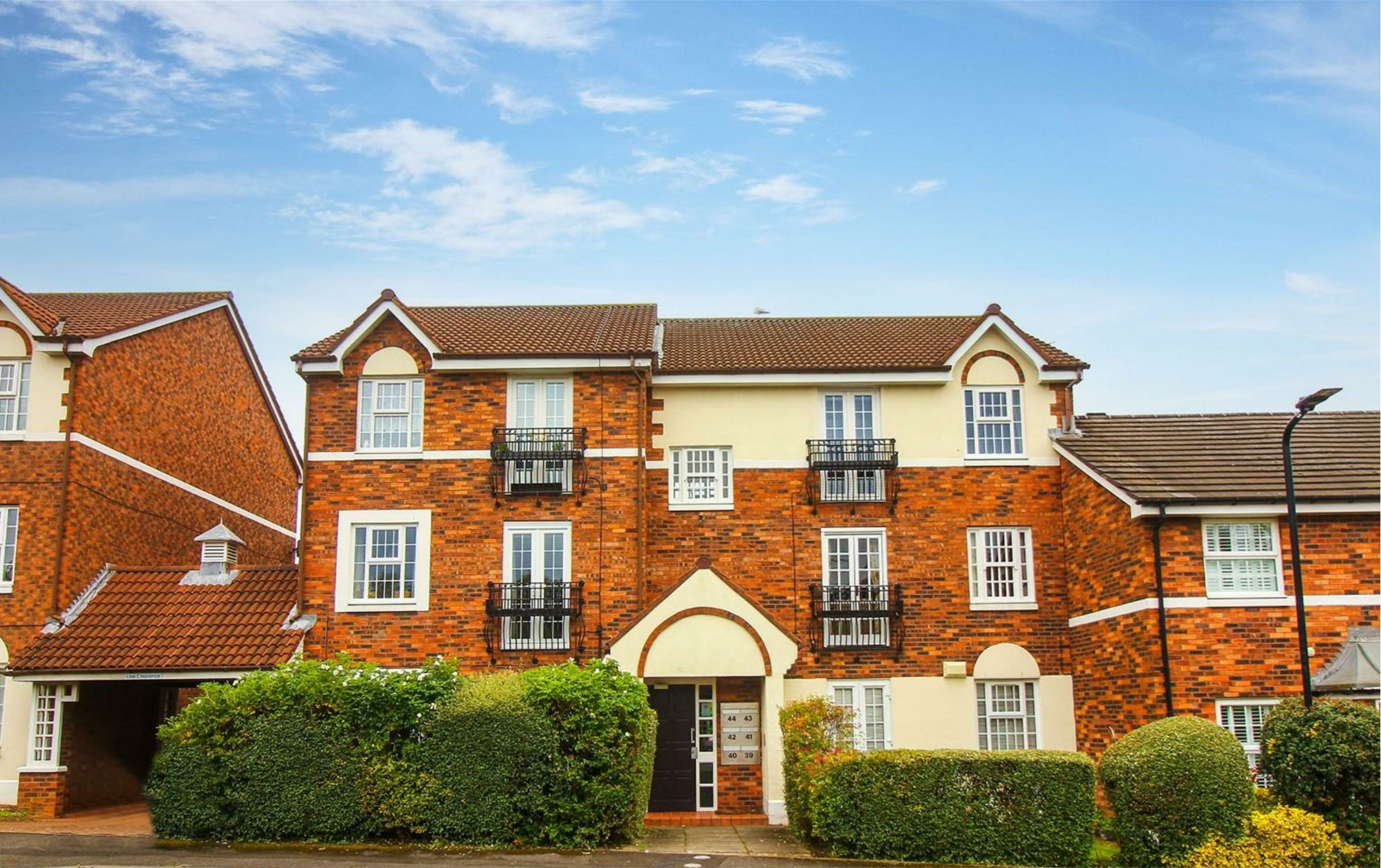
📍 Chathill Close, Whitley Bay NE25 9LN