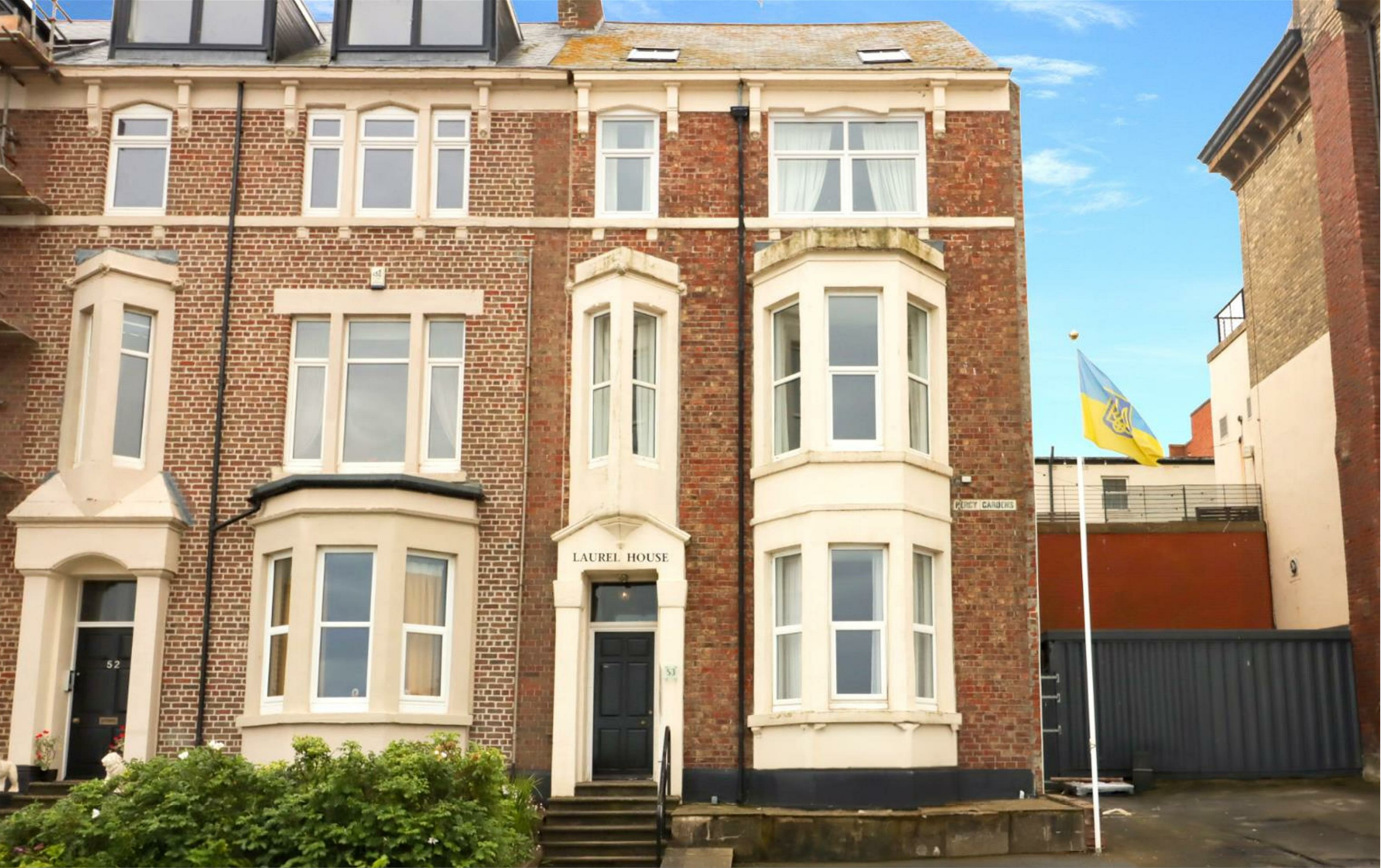
📍 Grand Parade, Tynemouth NE30 4ER