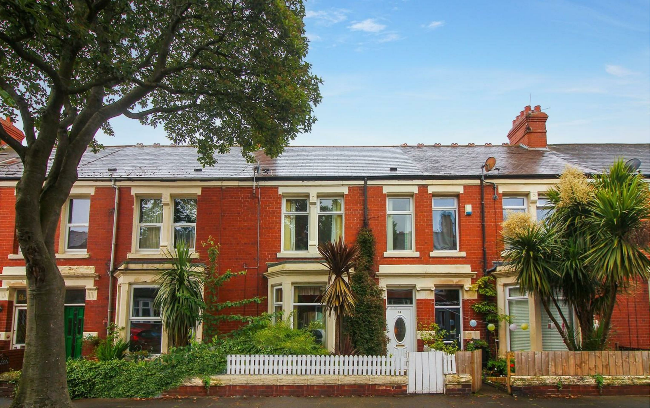
📍 Ventnor Gardens, Whitley Bay NE26 1QB