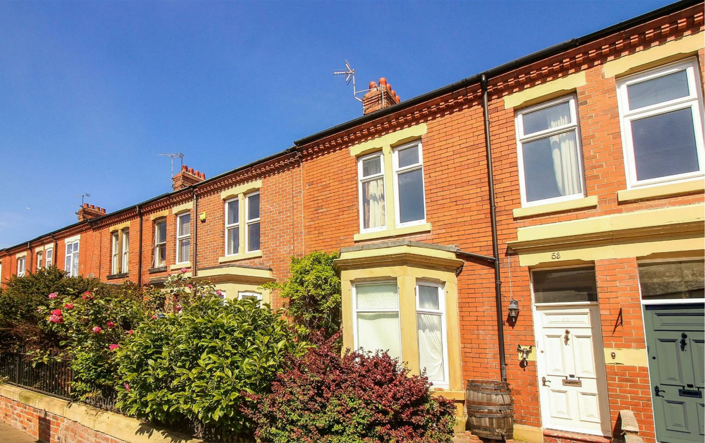
📍 Roxburgh Terrace, Tyne and Wear NE26 1DR